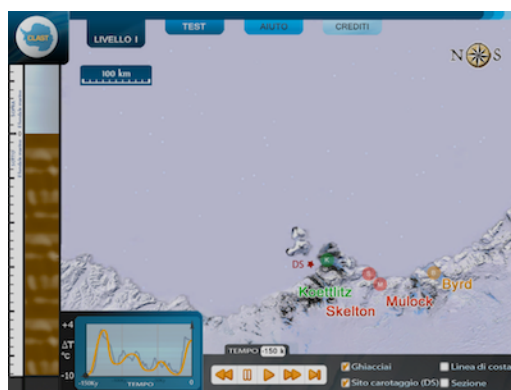
Scenario of Ross Sea area (in CLAST)

Select one of the following Figures A or B